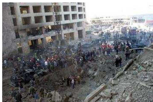
Scene of the detonation of 1000 kg of explosives used in assassination

Prosecutor for international tribunal investigating assassination of former Prime Minister Hariri files indictment with pre-trial judge; Nasrallah threatens to "cut off the hands" of anyone attempting arrest of Hezbollah members; turmoil grows following last week's collapse of government